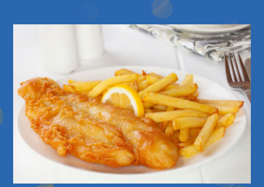
Clients at one property had fish and chips as a treat