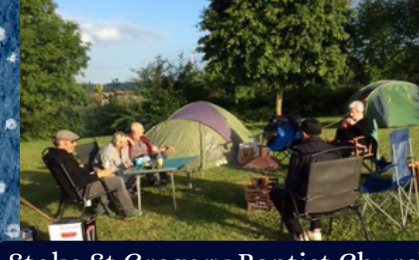
Stoke St Gregory Baptist Church joined us virtually as a group